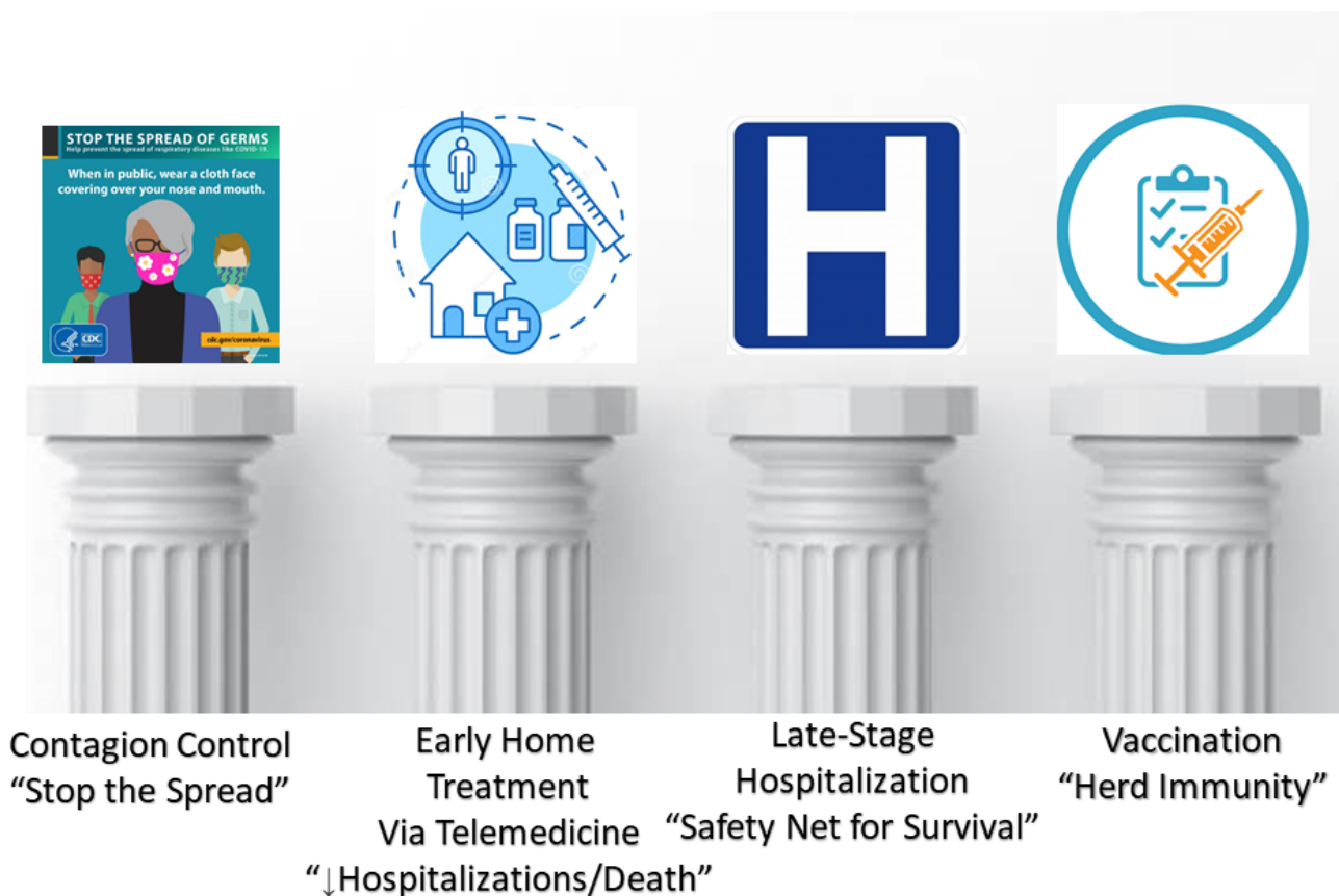
Fig. 1. The four pillars of pandemic response to COVID-19. The four pillars of pandemic response to COVID-19 are: 1) contagion control or efforts to reduce spread of SARS-CoV-2, 2) early ambulatory or home treatment of COVID-19 syndrome to reduce hospitalization and death, 3) hospitalization as a safety net to prevent death in cases that require respiratory support or other invasive therapies, 4) natural and vaccination mediated immunity that converge to provide herd immunity and ultimate cessation of the viral pandemic.

erson et al., 2020; Xu et al., 2020). Masks for all unaffected contacts within the home as well as frequent use of hand sanitizer and hand washing is mandatory in the setting when one or more family members falls ill. Sterilizing surfaces such as countertops, door handles, phones, and other devices is advised. When possible, other close contacts can move out of the house and seek shelter free of SARS-CoV-2. Findings from multiple studies indicate that policies concerning control of the spread SARS-CoV-2 are only partially effective and extension into the home as the most frequent site of viral transfer is reasonable (Hsiang et al., 2020; Xiao et al., 2020). One of the great advantages of home treatment of COVID-19 is the ability of an individual or family unit to maintain isolation and complete contact tracing. If therapy is offered in the home with delivery of medications, then trips to urgent care centers, clinics, and hospitals can be reduced or eliminated. This limits spread to drivers, other patients, staff, and healthcare workers. On the contrary, therapeutic nihilism on the part of primary care physicians and health systems drives anxiety and panic among patients with acute COVID-19 who feel abandoned, making them more likely to break quarantine and seek aid at urgent care centers, emergency rooms and hospitals.